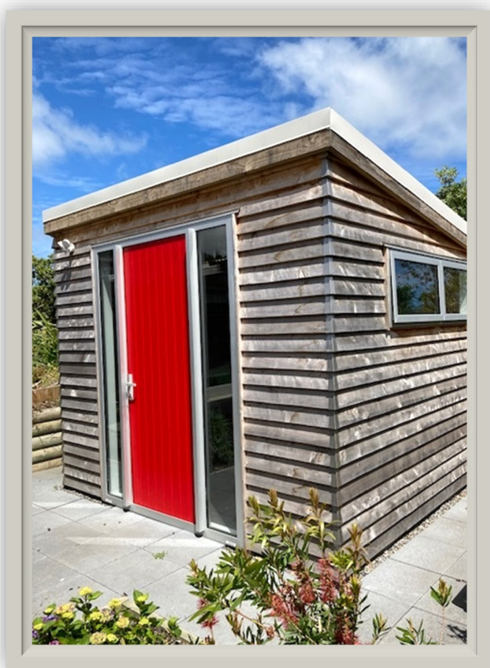
This is my study/prayer room which saved my life! Called Hufanga'anga which means place of safety or refuge.

We have learnt to communicate differently; to use social media to our advantage; to share our ups and downs (and our recipes); to photograph beautiful things like the spring flowers in our gardens; to be grateful; to marvel at the way our grandchildren are flourishing; to appreciate what is really important; even to embrace some suffering and know that Jesus, a Man of Sorrows, walks with us.