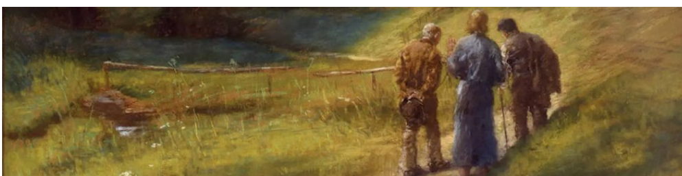
The Road to Emmaus by Fritz von Uhde

One day I was feeling a bit sorry for myself. I took a walk up Riddiford St. It was a nice sunny day. From the steps of the former church near the intersection with Russell Tce came the slurred call, "hey mister, want a drink?", and a bottle of goodness-knows-what was held out for me. No rational conversation was going to happen, however the open generosity of Jesus Christ reminded me again of what I am called to. And I get on with it!