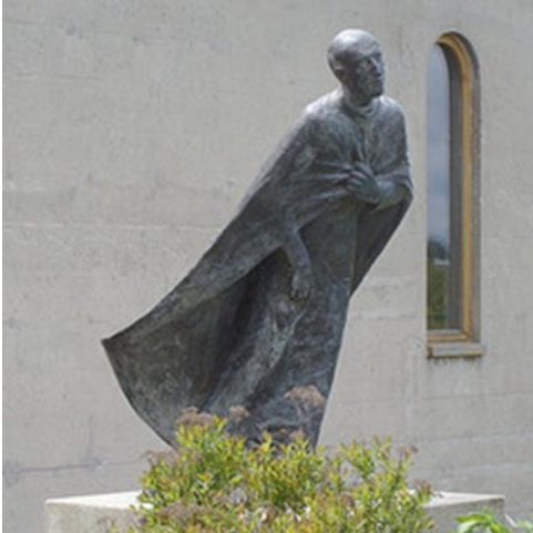
Statue of Saint Ignatius the Pilgrim at Guelph

2021 in New Zealand started out in a reasonably normal way, although we were aware of the world's problems with Covid 19. As a country of immigrants, most of us have links to other places, and we knew of separations, loss of life in our extended families or circle of friends. We rejoiced that we, as a small island nation, seemed to have beaten the plague and probably took a rather superior attitude towards other places that seemed to have mismanaged things with disastrous consequences.