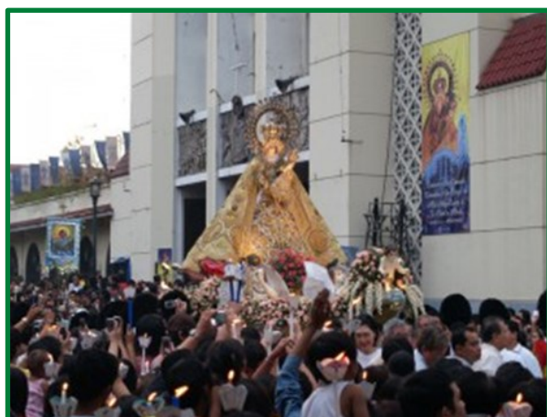
Filipino Marian devotion, one of the trademarks of Filipino Catholicism

(She is a former parishioner of the Sacred Heart Cathedral, until her entry to the religious life this January. Please include her vocation in your prayers)