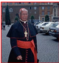
Cardinal Pio Taofinu'u.

The Adoremus Bulletin in its October Volume 1996 issue, defines inculturation as "The creative and dynamic relationship between the Christian message and a culture". In 1993 Cardinal Pio Taofinu'u , the Archbishop of Samoa explained that, "inculturation facilitates not only the integration of Cultural values but also the purification of these elements which are not in keeping with the demands of the Gospel". He used Faith and Patriotism as the two pillars of life for him as a Samoan. Faith, a gift from God and a heavenly power justifies whatever we do for the Kingdom. Patriotism is a human, nationalistic power by which we do anything for the betterment of our country. Patriotism can be inculturated by using that power in the name of Christ.